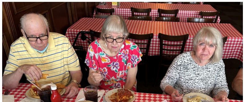
Lunch Bunch at Spaghetti Works June 2