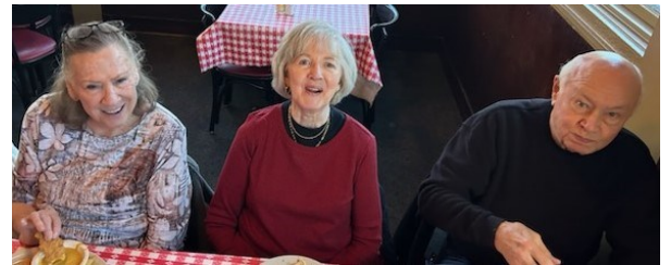
February Lunch Bunch